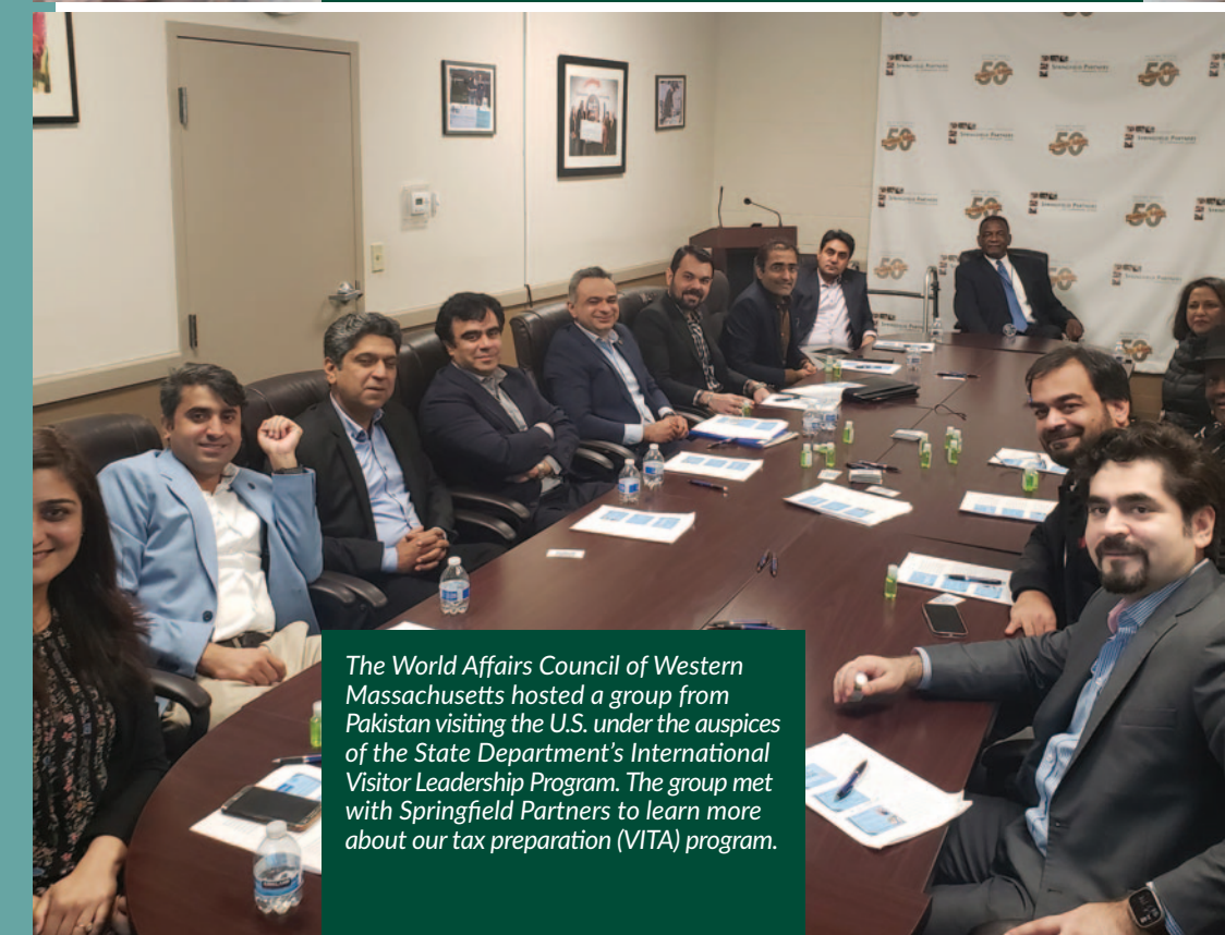
The World Affairs Council of Western Massachusetts hosted a group from Pakistan visiting the U.S. under the auspices of the State Department's International Visitor Leadership Program. The group met with Springfield Partners to learn more about our tax preparation (VITA) program.