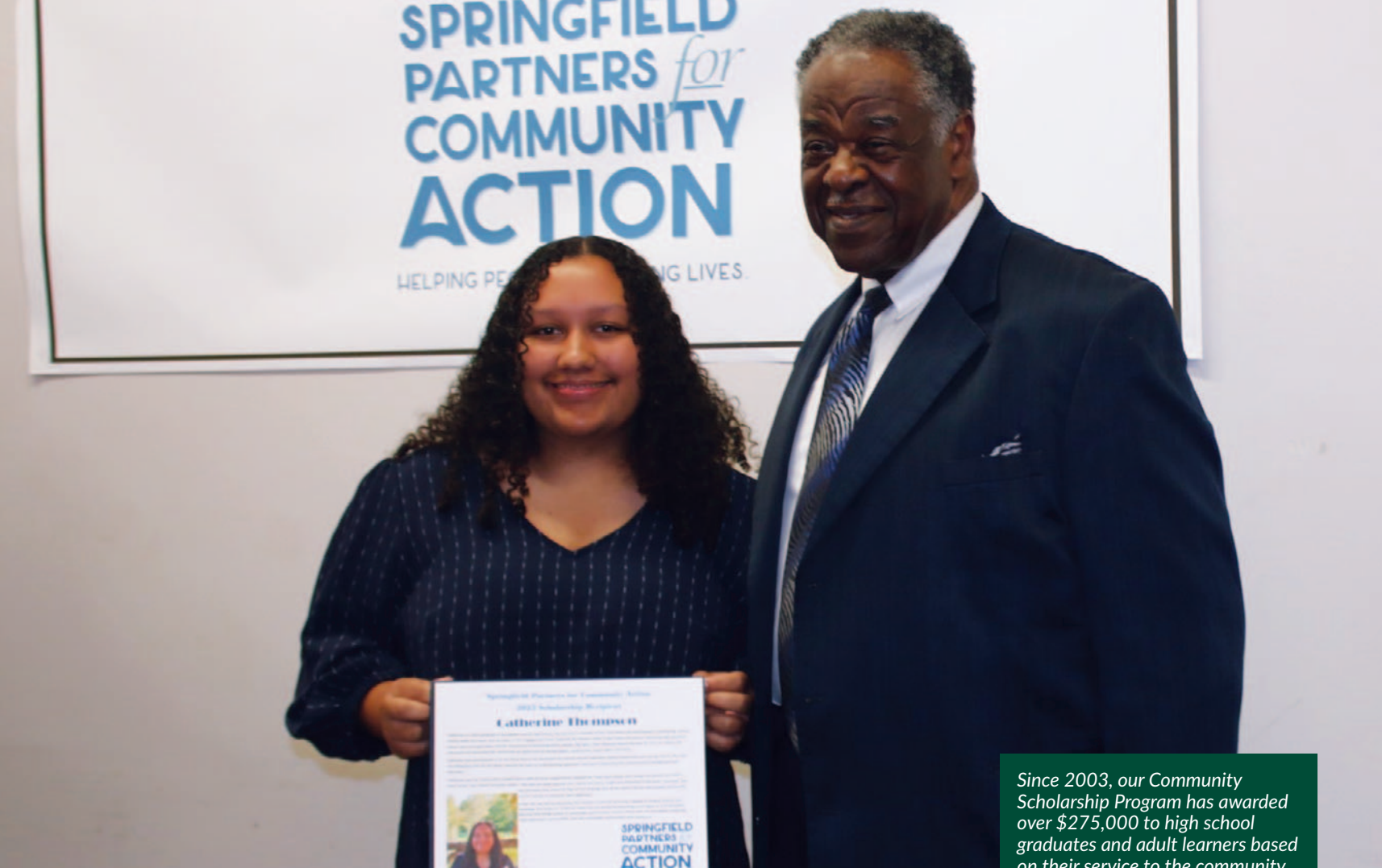
Since 2003, our Community Scholarship Program has awarded over $275,000 to high school graduates and adult learners based on their service to the community. Pictured are some of our 2023 scholarship recipients with our Board.