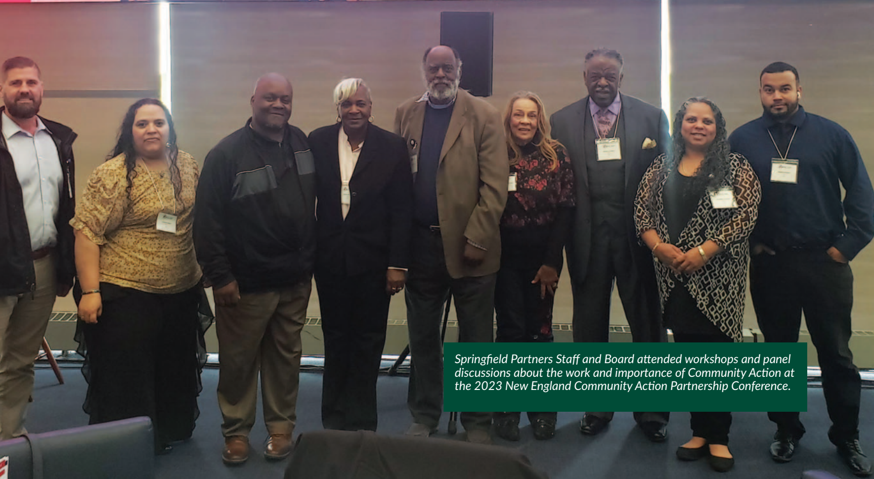
Springfield Partners Staff and Board attended workshops and panel discussions about the work and importance of Community Action at the 2023 New England Community Action Partnership Conference.