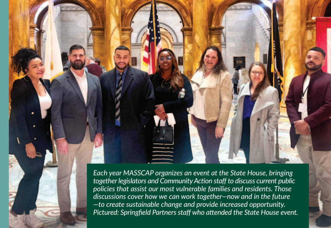
Each year MASSCAP organizes an event at the State House, bringing together legislators and Community Action staff to discuss current public policies that assist our most vulnerable families and residents. Those discussions cover how we can work together—now and in the future—to create sustainable change and provide increased opportunity. Pictured: Springfield Partners staff who attended the State House event.